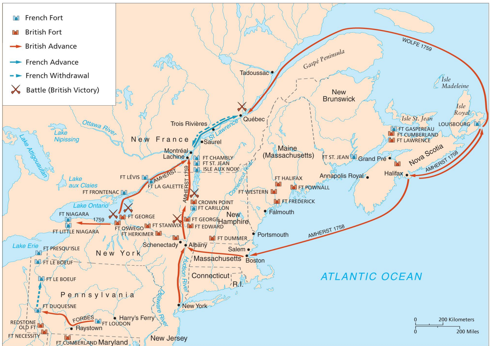
★ British Successes, 1758-1763