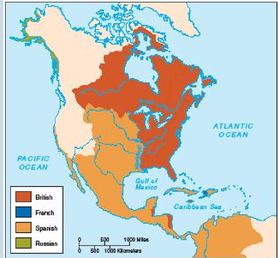
★ European Claims in All of North America, 1763