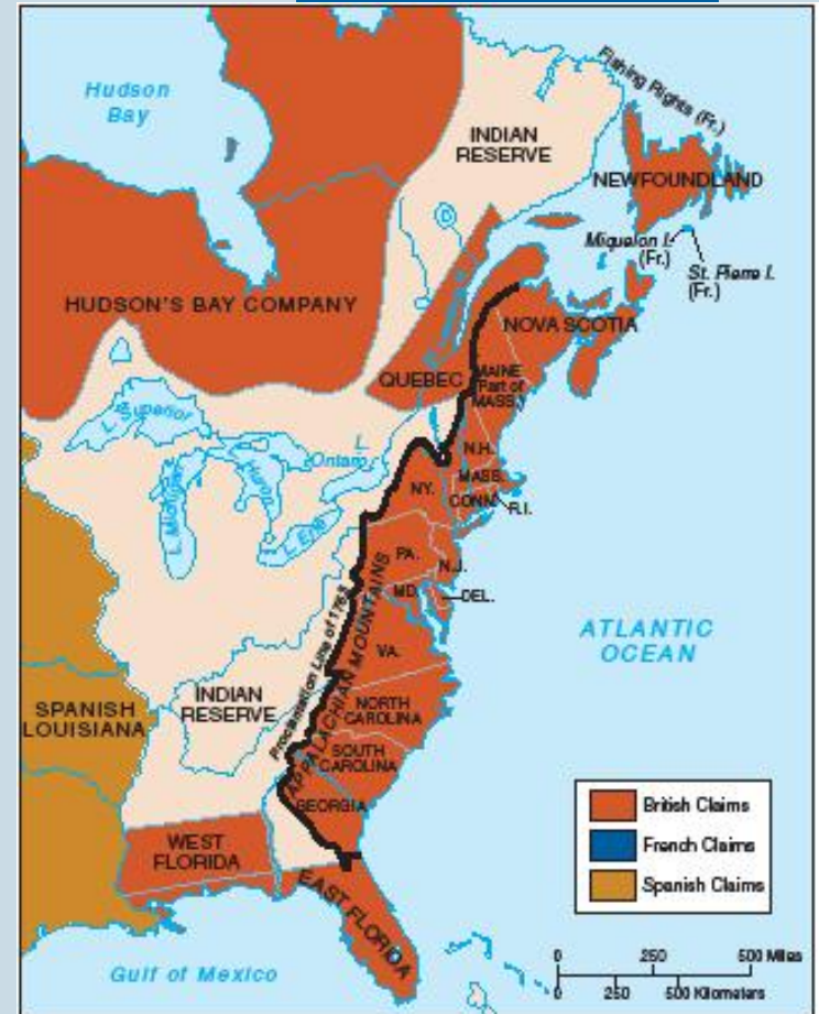
★ Proclamation of 1763