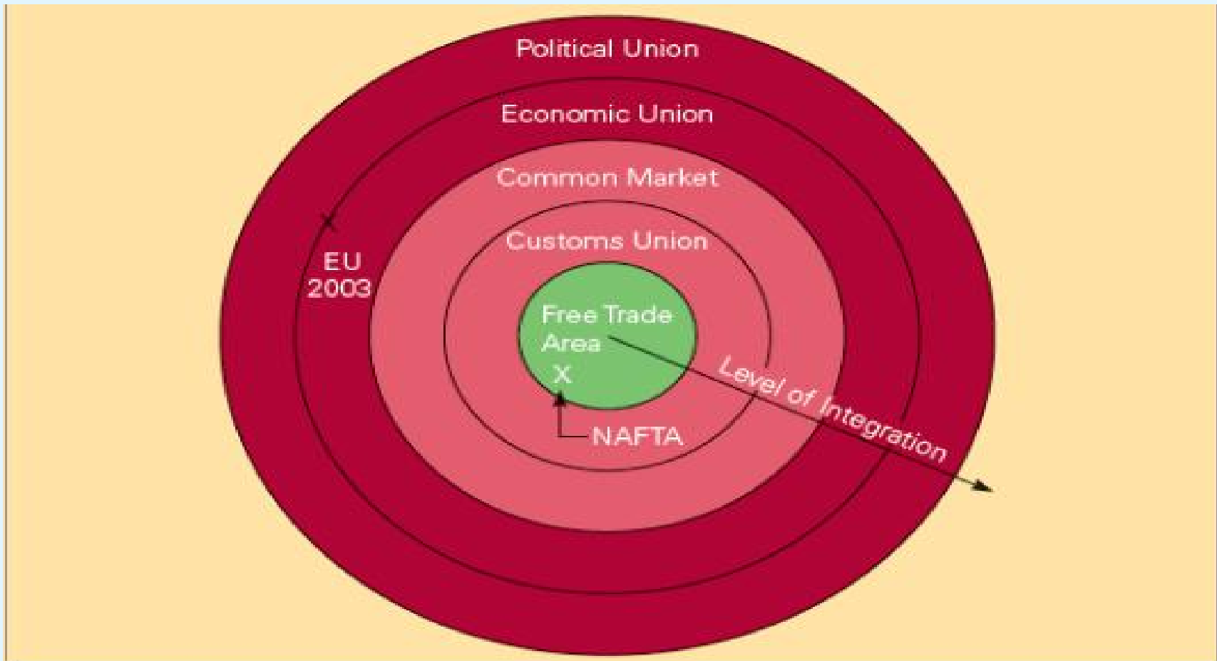
Levels of Economic Integration