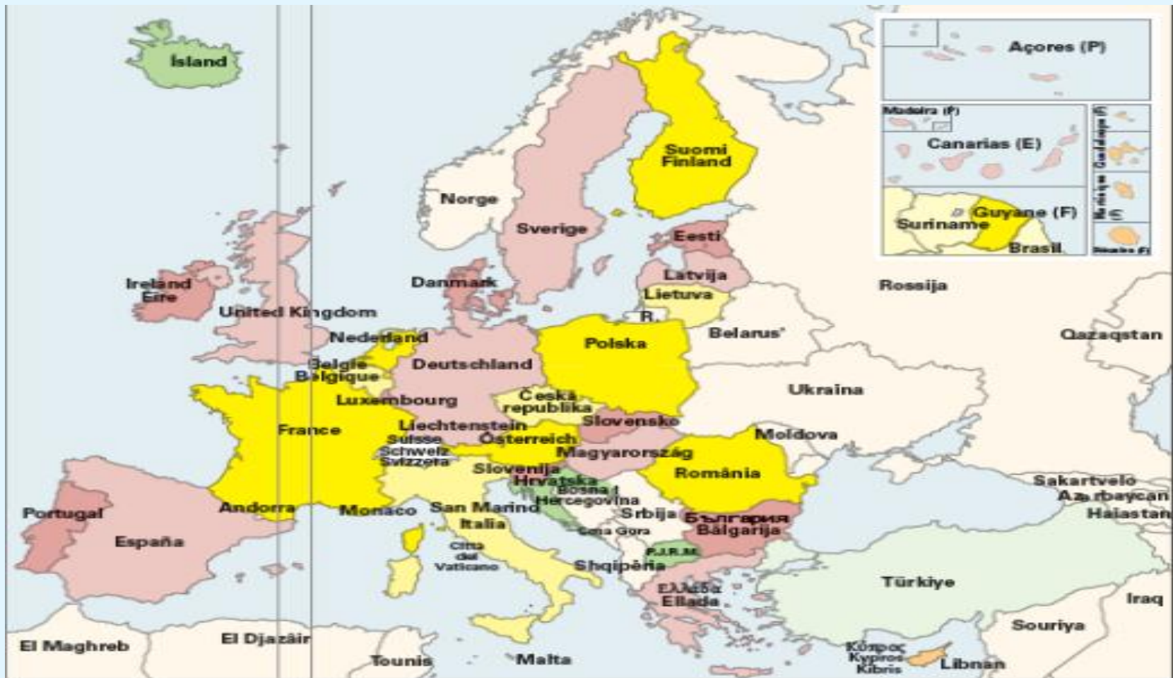
Member States of The European Union in 2011