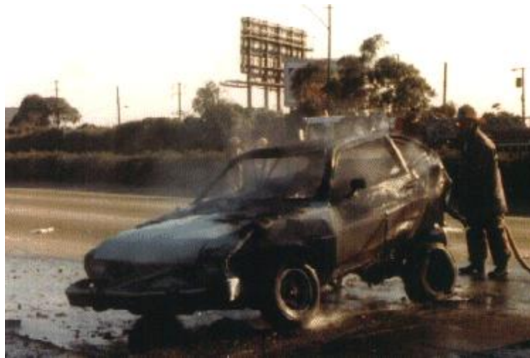
The Ford Pinto